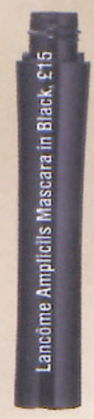
Lancôme Amplicils Mascara in Black, £15