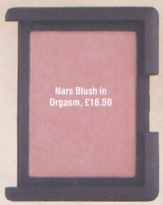
Nars Blush in Orgasm, £16.50